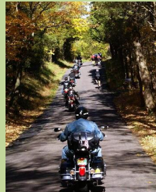
Point to Point Ride sponsored by: Lea's Prayers & Postage, Inc. Sunday, June 6, 2010 Sign up: 11:30a.m. @

Just received your packages in the mail a couple days ago. Thank you so much for them. I was just telling the other Marines that we were running low on snacks and then your 2 packages shows up. It was great and now we have snacks. We always appreciate everything that you all do for us while we are away from our family and friends. It means a lot to us