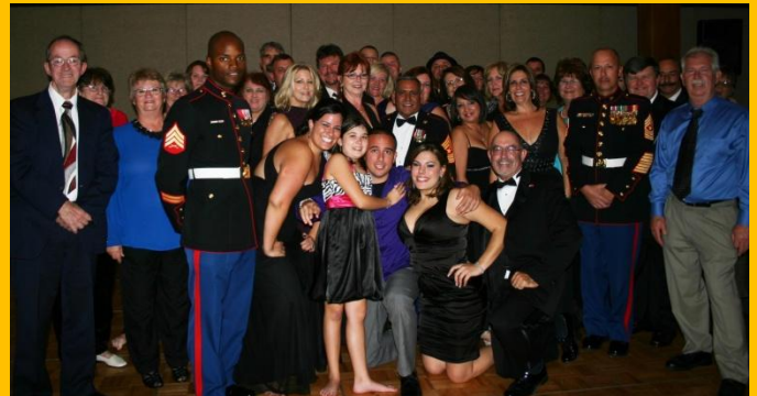
2009 USMC Family Birthday Ball

This info can be emailed to Admin@USMCFamilySupport.org