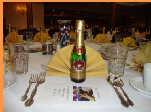
5 th Annual Birthday Ball Huge Success

On Saturday, November 13 th T.A.M.P.A. members, supporters and friends came together for a wonderful night of celebration Marine family style.