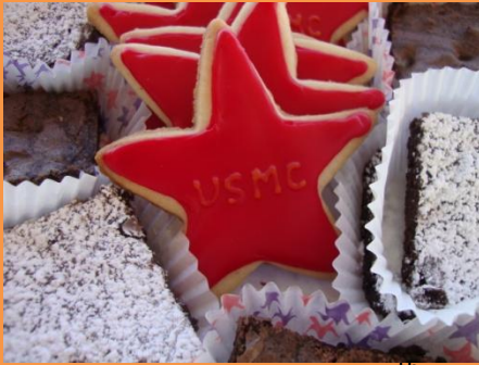
Family Day Desserts For 4 th Tracks

On Sunday, November 21 st some of the group transported and distributed hundreds of desserts for Marines and their families at the Family Day event the 4 th Amphibious Assault Reserve in Tampa.