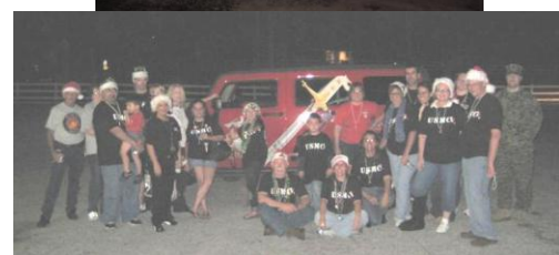
Pinellas Park Christmas parade 2009